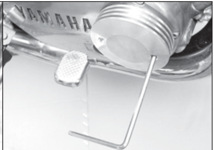
6. Place copper washers under allen screws and use these to install the outer cover. Done !