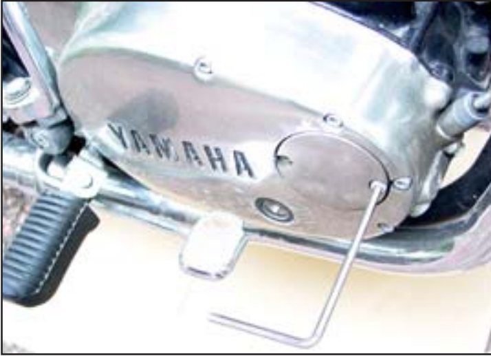
1. Remove Stock Oil Filter Cover.

Kit Uses replaceable filter element XS#15-6505