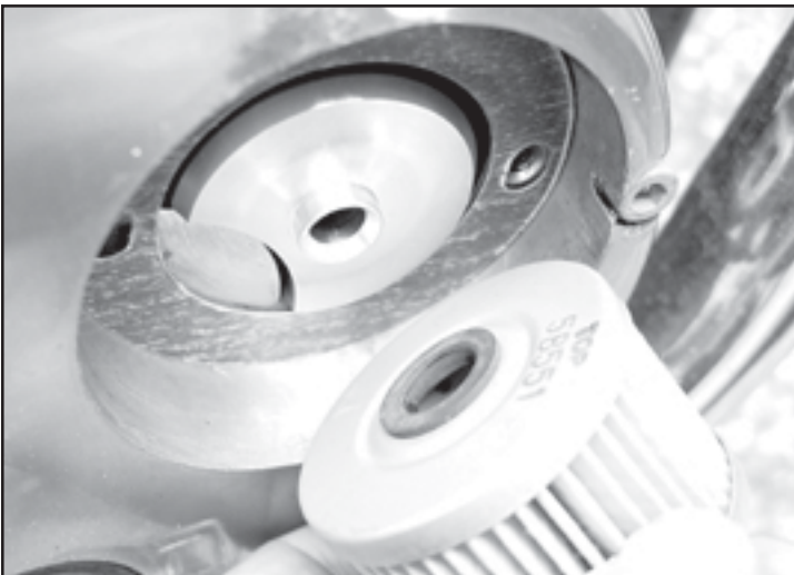
5. Place Oil Filter ( End with rubber seal ) onto the raised center of the Aluminum insert.