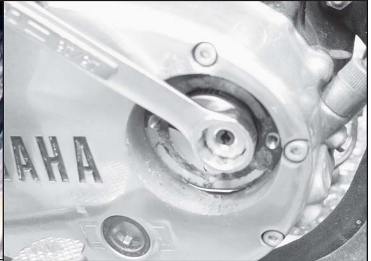
2. Remove the filter bolt assembly and filter screen.